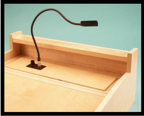
LA-18-HI Installation Illustrated

The Littlite LA series provides a sleek, flush mount light assembly. These products are pre-assembled and pre-wired at the factory so installation is quick and easy.